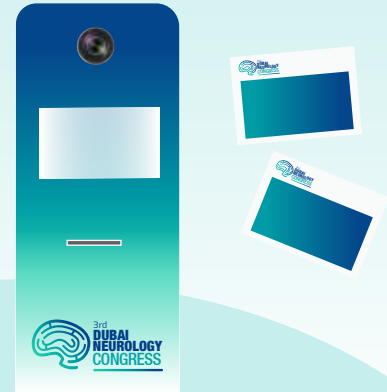
Photo Booths allow attendees to ENGAGE each other, CAPTURE their moment at the Congress, and SHARE their experience with others.

Photo Booths create impactful brand/congress experience and creative visuals that give attendees engaging results as well as a take home memorabilia from the Congress.